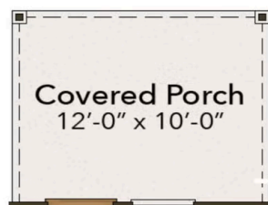
Rear Covered Porch