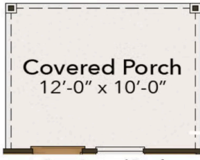
Rear Covered Porch