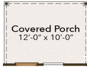
Rear Covered Porch