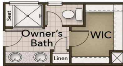
Deluxe Owner's Bath