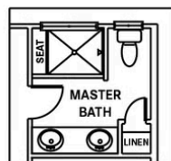
OPT. DELUXE MASTER BATH