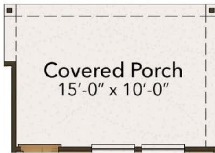
Extended Rear Covered Porch