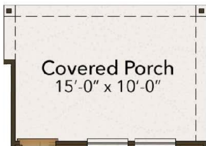
Extended Rear Covered Porch