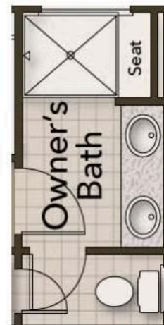
Deluxe Owner's Bath