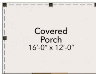
Rear Covered Porch