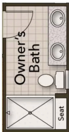
Deluxe Owner's Bath