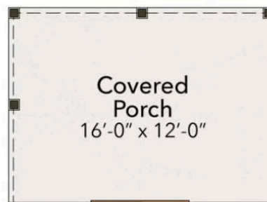
Rear Covered Porch