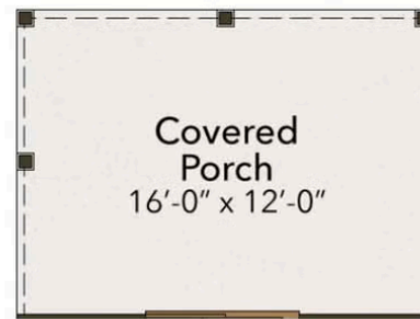
Rear Covered Porch