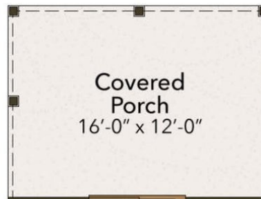
Rear Covered Porch