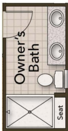
Deluxe Owner's Bath