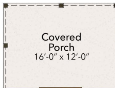
Rear Covered Porch