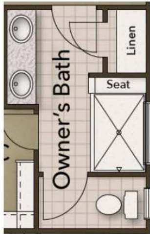
Deluxe Owner's Bath