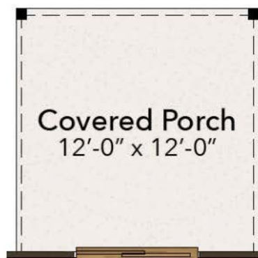
Rear Covered Porch