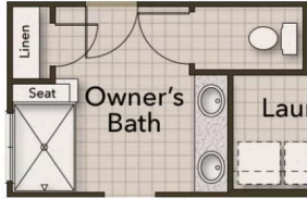
Deluxe Owner's Bath