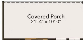
Extended Covered Porch