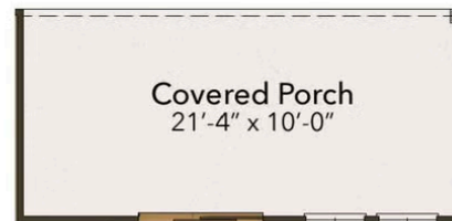
Extended Covered Porch