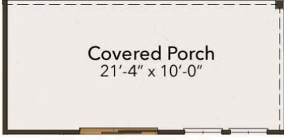
Extended Covered Porch