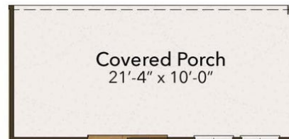
Extended Covered Porch