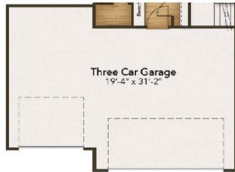
Three Car Garage