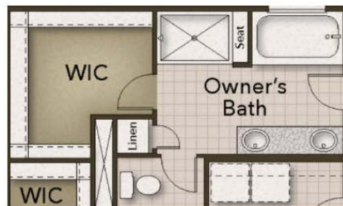
Deluxe Owner's Bath