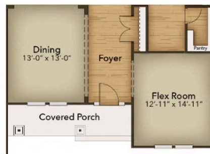
Alternate Dining Layout