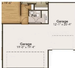
Three Car Garage