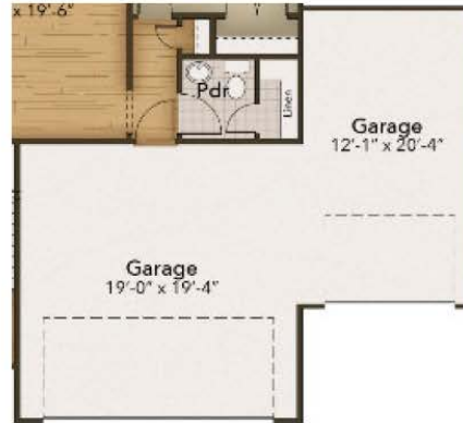
Three Car Garage