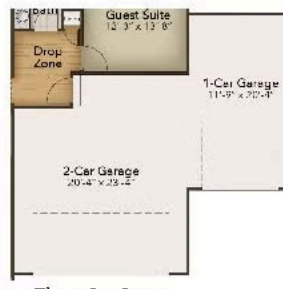
Three Car Garage