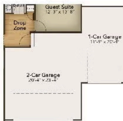
Three Car Garage