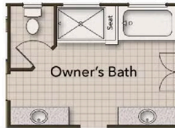
Deluxe Owner's Bath