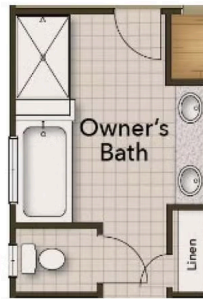
Deluxe Owner's Bath