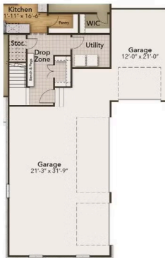
Sideload Third Car Garage with Single Car Garage