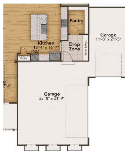
Sideload Three Car Garage