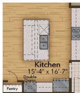
Gourmet Kitchen Island