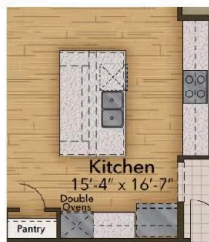
Gourmet Kitchen Island