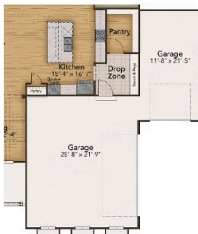
Sideload Three Car Garage