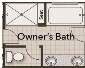
Deluxe Owner's Bath