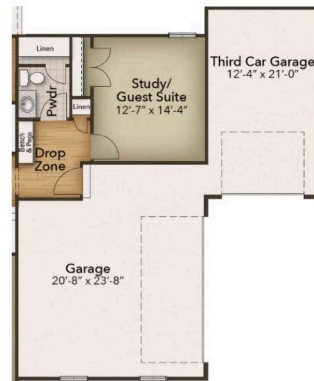
Sideload with Third Car Garage